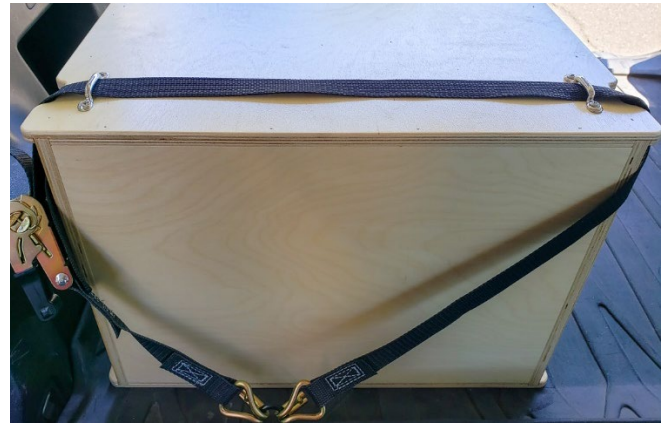
Anchor point behind Pantry (for mounting one Pantry unit. Kitchen shown.)