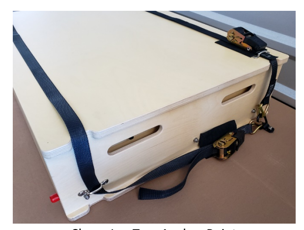
Closer In - Two Anchor Point Mounting Configuration

Note: The two anchor point mounting configuration is less effective at preventing side sway than the four anchor point configuration. However, both are effective at preventing the Kitchen from tilting out of your vehicle.