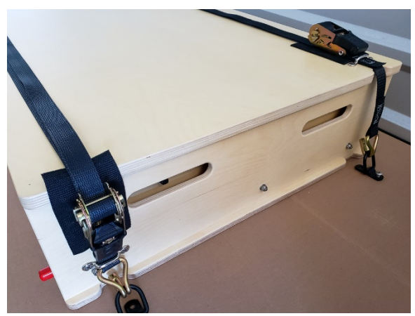
Closer In - Four Anchor Point Mounting Configuration

If you only have two anchor points: Run the front adjustable end strap through the side footman loop and thread it into the shorter ratchet strap end.