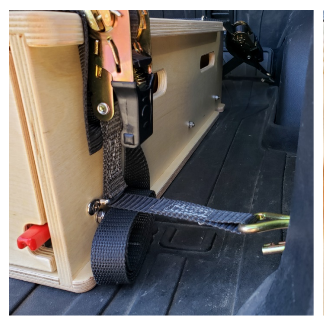
Further Out - Four Anchor Point Mounting Configuration

If you only have two anchor points: Run the front adjustable strap end through the side footman loop and thread it into the longer ratchet strap end.